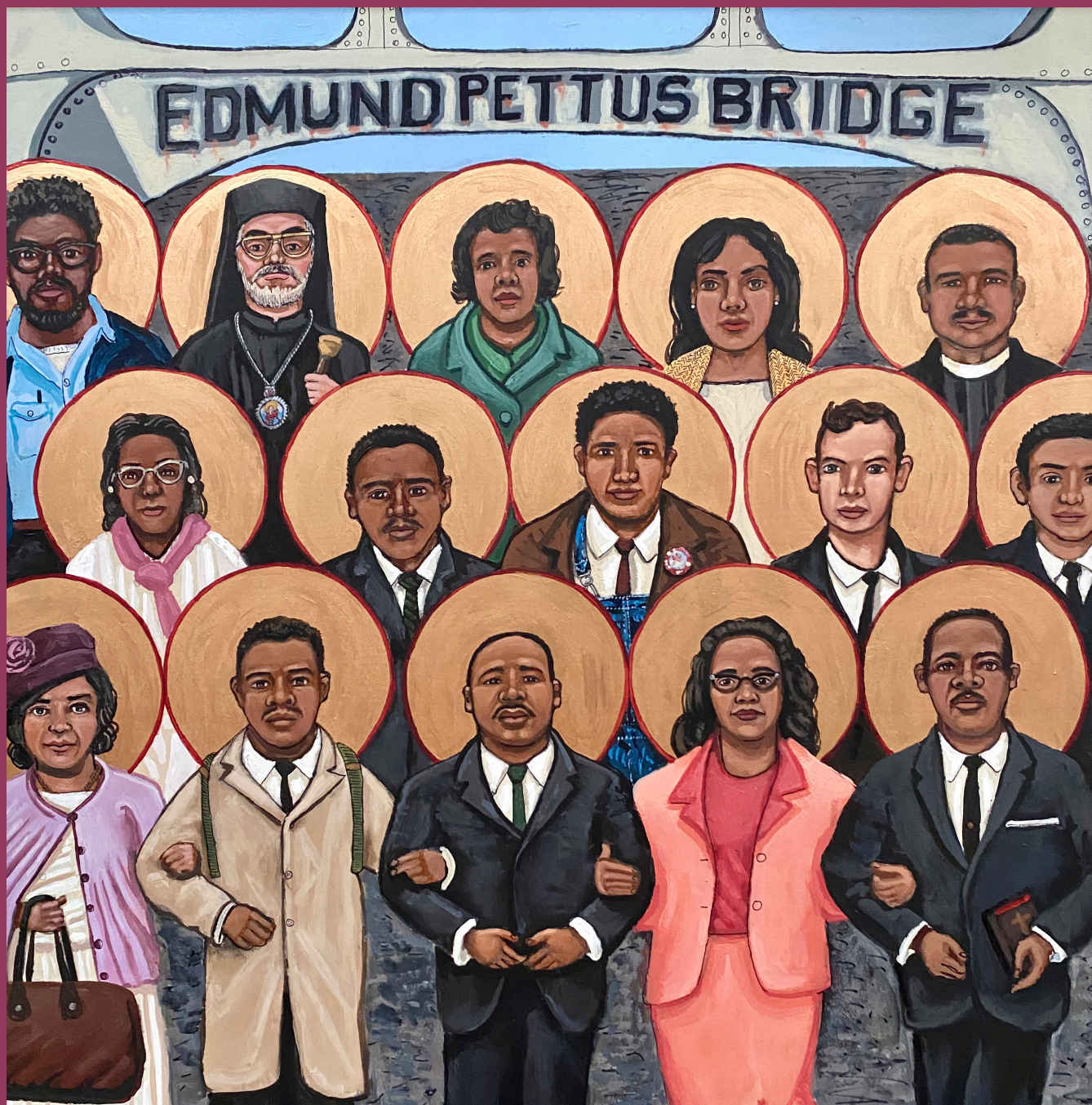
Kelly Latimore Icons