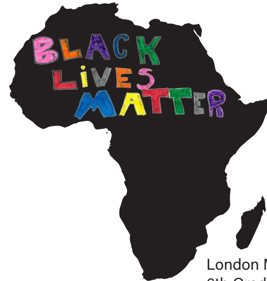
London McIntosh 6th Grade