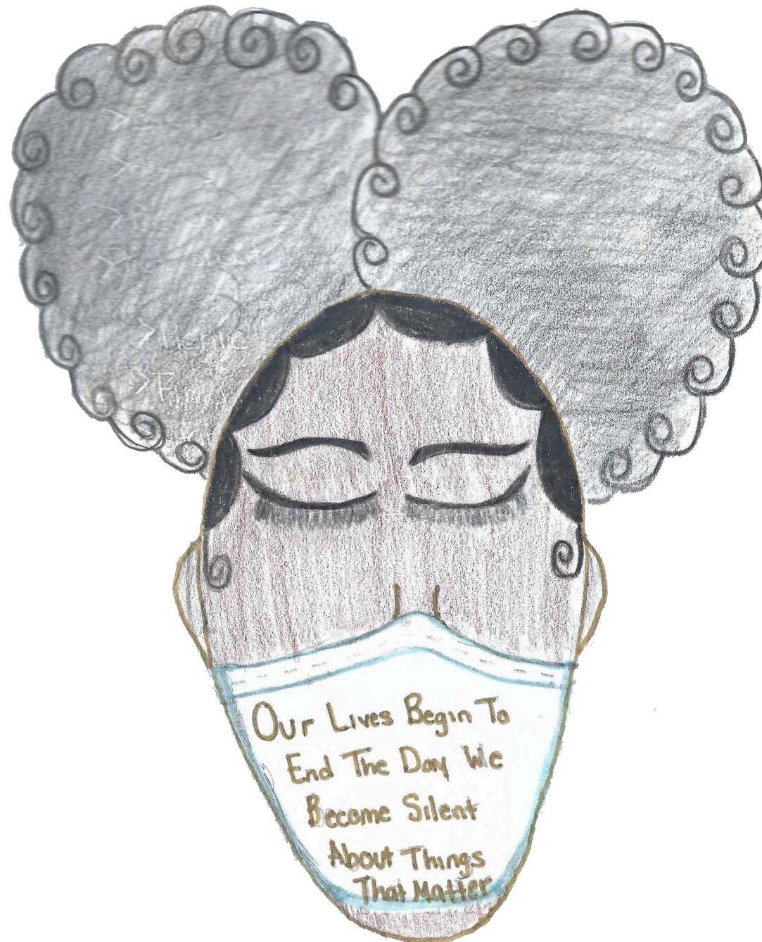
Mel B-S 10th Grade