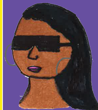
MEGAN THEE STALLION